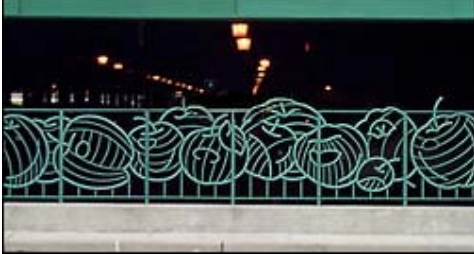
Ronald Reagan National, Washington