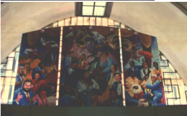
Interiors can be art, in architecture and with objects of art (New Orleans International)