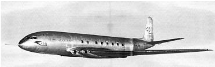
Click image for larger view (75 Kb)

The Comet 1 in BOAC colors made it's first regular passenger flight on May 2nd 1952. The route was London/Heathrow - Johannesburg. As the range of the delivered Comets wasn't enough to cross the Atlantic, BOAC used the jetliner for it's Empire routes to Africa and Asia. Passengers marvelled over the smoothness of the flight way above clouds and bad weather. The Comet 1 was an instant success. This was indeed the future of flying. All flights were almost full, the load factors being 90 %.