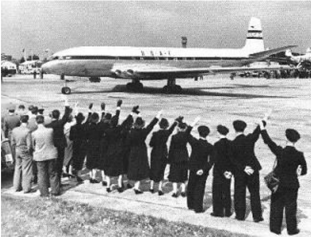
BOAC staff and press waving goodbye to the Comet 1 for the first flight of the very first passenger jet