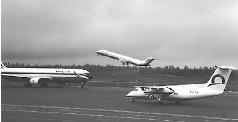
Delta Boeing 767 and Horizon Dash 8-100 taxiing and TWA MD-80 taking off

A few pictures taken at Washington state's biggest airport on a cloudy June morning