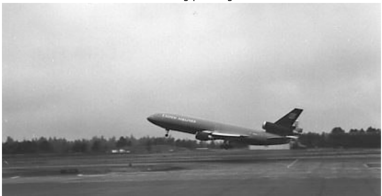
Northwest DC-10 taking off RWY 16L