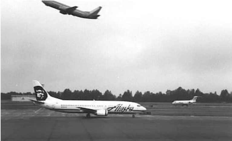
Alaska Boeing 737 taxiing to RWY 16L, Horizon Fokker F28 just landed RWY 16R and taxiing to gate, Southwest Boeing 737 just after take off