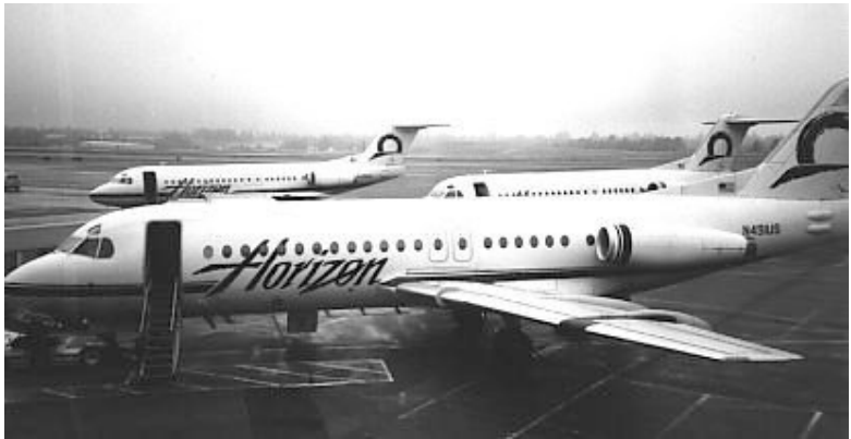
A set of Horizon Fokker F28s awaiting passengers